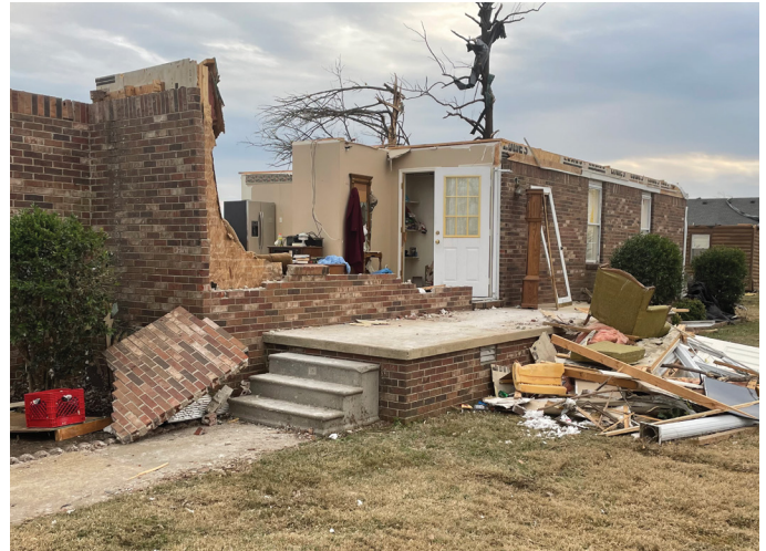
The House in a Box program will help many families in Kentucky and Tennessee obtain essential household items to make their rebuilt homes livable. The photo above shows a Tennessee home that was destroyed by the tornadoes.

of families across Kentucky and Tennessee with this complex and sometimes overlooked aspect of recovery. This program will provide these families with basic furniture and household supplies, such as beds, linens, dinettes, pots and pans, and other essential items — a “house in a box,” so to speak.